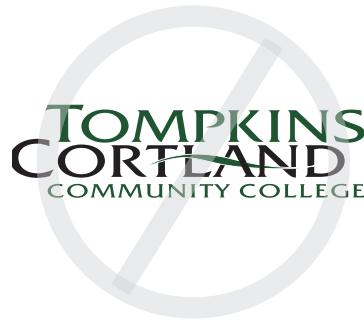
DO NOT STRETCH

The most fundamental element of branding a college is the logo.